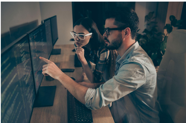
Figure 1: The Cyber Exposure Workshop can be delivered remotely or on-site.

When the service concludes, you will have a custom-built roadmap and operating plan for your vulnerability management program, designed specifically to meet your security and business objectives.